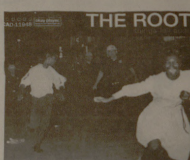
things fall apart The Roots CD