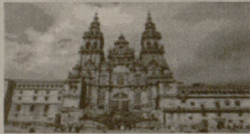
"Convivir en Espana"

Thursday, February 25, 1999 7:30 p.m. MSC 223-J