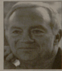
— JERRY JONES COWBOYS OWNER

"We made positive progress last year, and I feel good about our immediate future and long-term future."