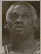
-DENNIS RODMAN NBA FREE AGENT

"What will make me happy is if I can bring this city a ring just like I did in Chicago," he said. "I'm here just because I want to make people happy. I miss entertaining. I miss entertaining for the people. I play for the people, I give the people what they want."