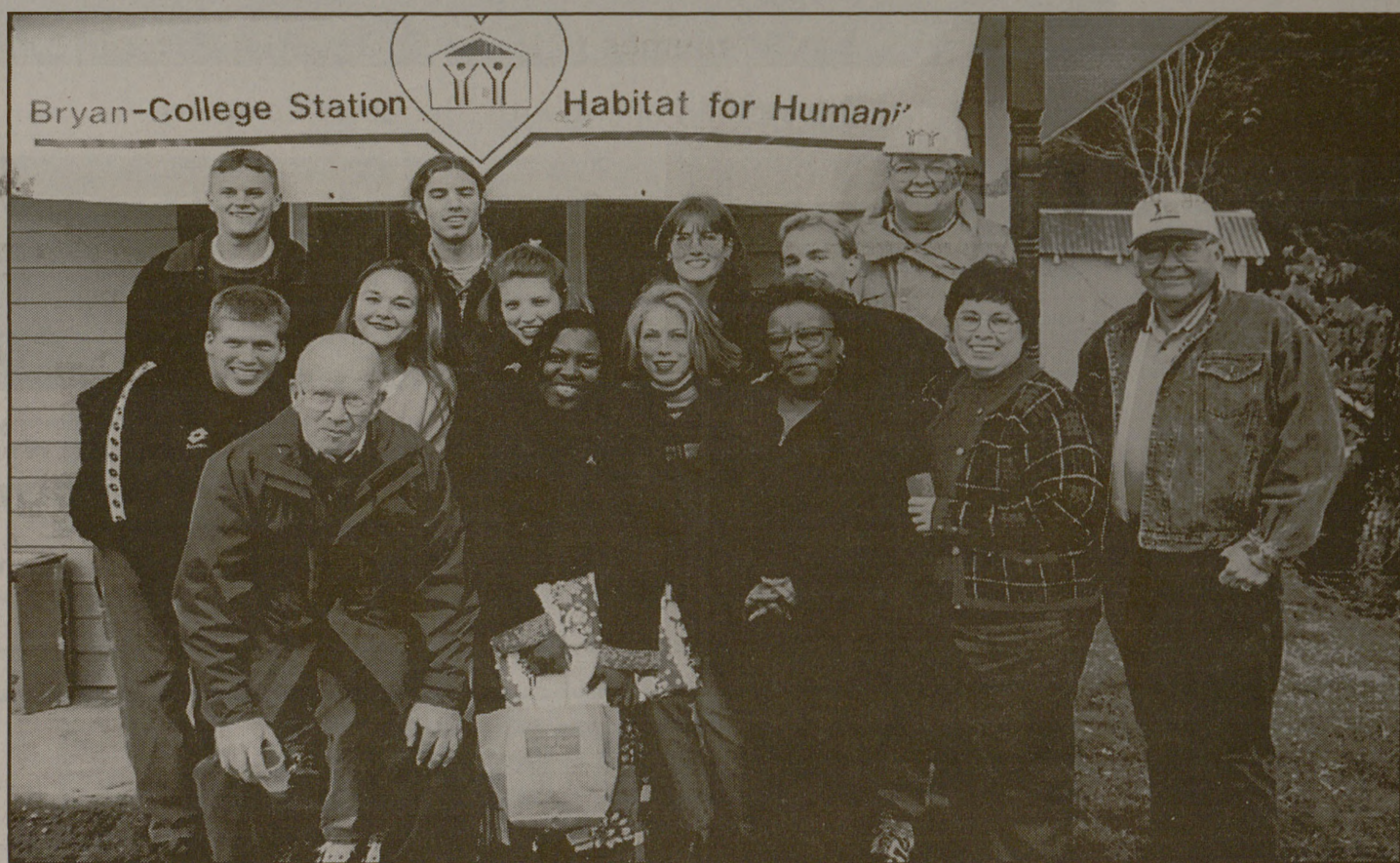
Texas A&M Habitat for Humanity Chapter and Norwest Bank - Bryan/College Station Representatives.