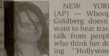
NEW YORK (AP) — Whoopi Goldberg doesn't want to hear trash talk from people who think her doing "Hollywood Squares" is a comedown for the Academy Award-winning actress.

"I don't need to have three films coming out and watch my hair fall out worrying about the opening weekend gross," Goldberg says in the Feb. 13-19 TV Guide. "I like this schedule and the money is good." Through her clout, the "Hollywood Squares" center square and executive producer has been able to get such guests as Robin Williams, Billy Crystal, Danny Glover, Melanie Griffith, Rosie O'Donnell,