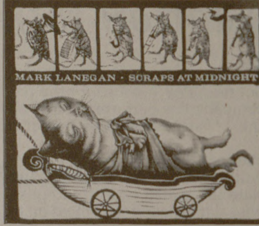
Mark Lanegan Scraps at Midnight Sub Pop Records

On his third solo effort, Mark Lanegan, lead singer of the Screaming Trees, has put together yet another worthwhile album. His first two solo efforts were mainly acoustic, and Scraps At Midnight is no different.