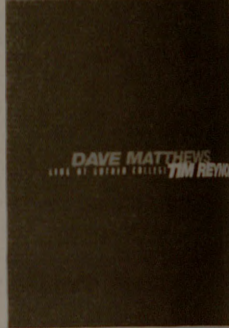
Dave Matthews and Reynolds Live From Luther College RCA Records

Dave Matthews and league Tim Reynolds' disc dissertation on the performances on Live at Luther College .