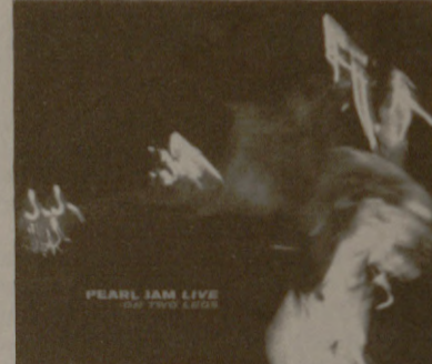
Pearl Jam Live on Two Legs Epic Records

This is classic Pearl Jam. Live on Two Legs is Pearl Jam's first live album released, and like most everything else they have put out, it is an excellent piece of work.