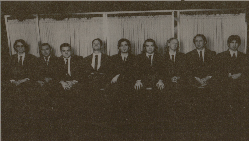
The Ugly Americans, a funk band from Austin, will play at The Theater Friday night.

The Ugly Americans, who regularly moonlight under the name the Scabs, have slowly built a reputation in cities around Texas as a