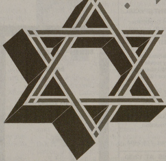
TRAVIS IRBY The Battalion

Jewish faith celebrates passage into a new year and a new person