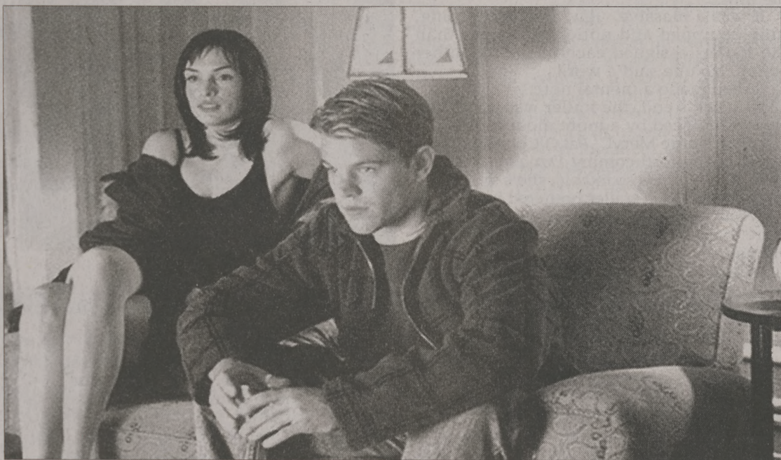
Matt Damon and Famke Jansen star in the new Miramax release Rounders .