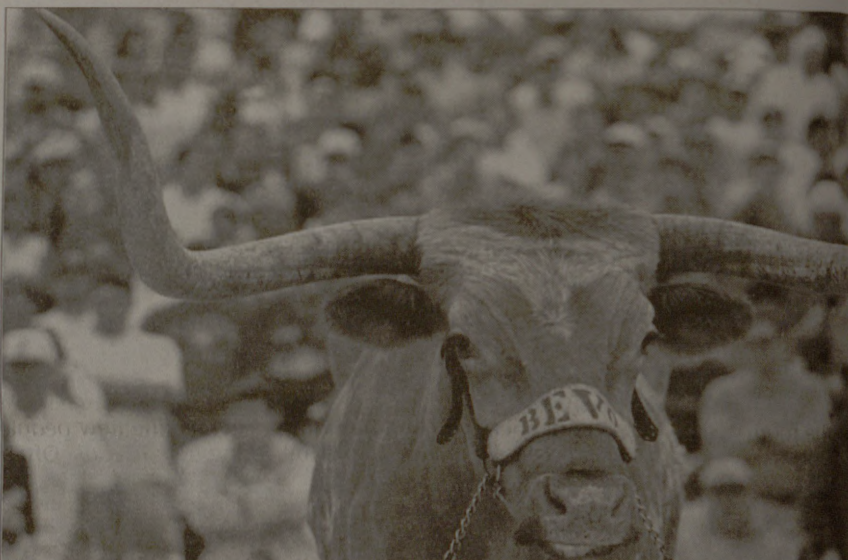
The Texas Longhorns will face UCLA on Saturday in a rematch of last year's 66-