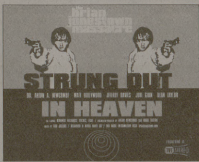
The Brian Jonestown Massacre Strung Out In Heaven

Also worthy of a listen (if you can find them) are Sunshine or Noir? and Tropic of Capricorn . Possum Dixon's only two EP's available on CD. (B)