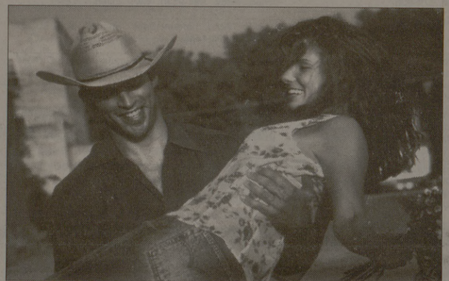
Justin (Harry Connick Jr.) and Birdie (Sandra Bullock) smarm it up Texas-style in this summer's most recent dose of romantic match-making celluloid, Hope Floats .