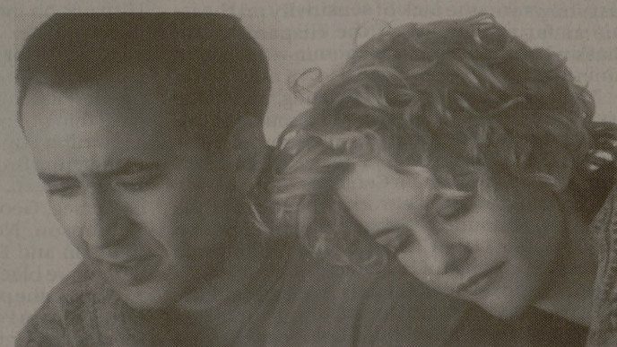
Nicolas Cage (Seth 'Plate') and Meg Ryan (Dr. Maggie Rice) star in City of Angels , a romantic drama dealing with hope and desire. She cannot be there to help them.

Luckily, Seth runs into Dennis Franz who was once a messenger himself and one day decided to literally