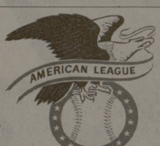
WEST Part 6 in a 7-part series