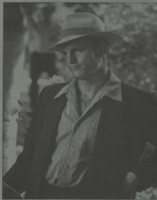
WOODY HARRELSON PLAYS HARRY BARBER IN THE NEW FILM PALMETTO.

The cast of Palmetto — Harrelson, Shue, Gershon and Michael Rapaport — is one thing that may attract people to see the film; the act-