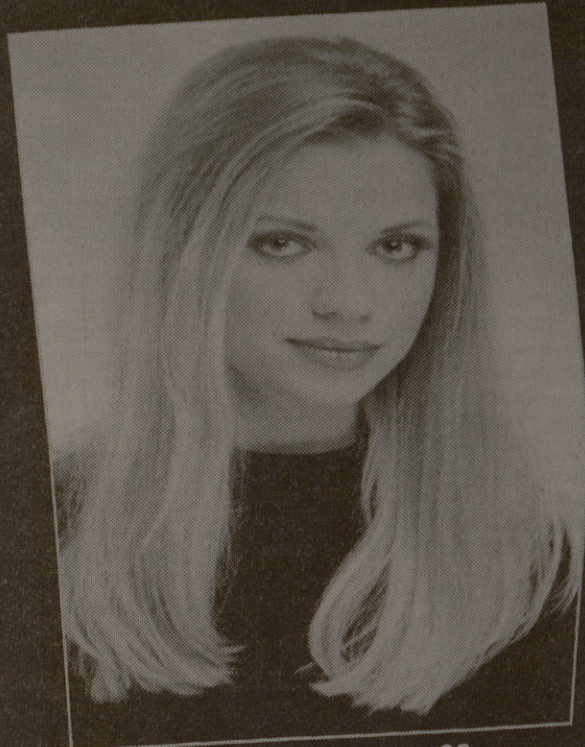
Valentina Lisitsa, piano, age 26

...with prodigy pianist Valentina Lisitsa and 35 of her closest musician friends.