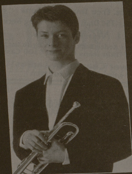
Sergei Nakariakov, trumpet, age 19

...with prodigy trumpeter Sergei Nakariakov and 35 of his closest musician friends.