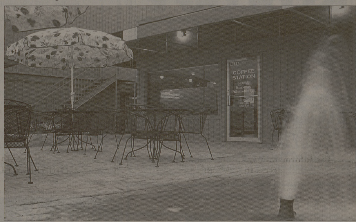
THE COFFEE HOUSE IS LOCATED AT 907-A HARVEY ROAD. ITS GRAND OPENING WILL BE TODAY, WITH A PERFORMANCE BY RUTHIE FOSTER FROM 8 - 11 P.M.