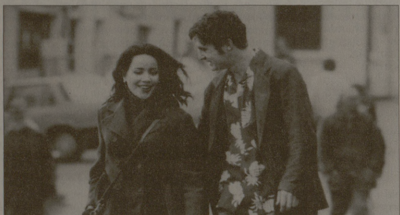
Janeane Garofalo and David O'Hara star in the new film The Matchmaker , a romantic comedy that finds Garofalo traveling to Ireland for a business trip.

The Matchmaker Starring Janeane Garofalo Directed by Mark Joffe Rated Pg-13 Playing at Hollywood 16 ★★★ (out of five)