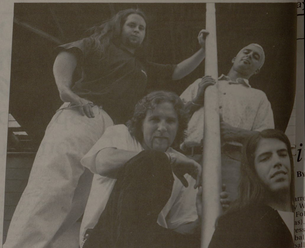
Seven Mary Three