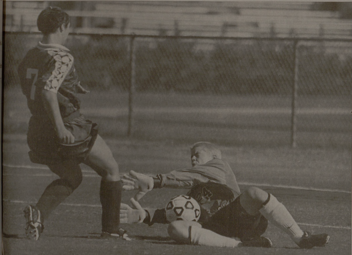
DAVE HOUSE/THE BATTALION