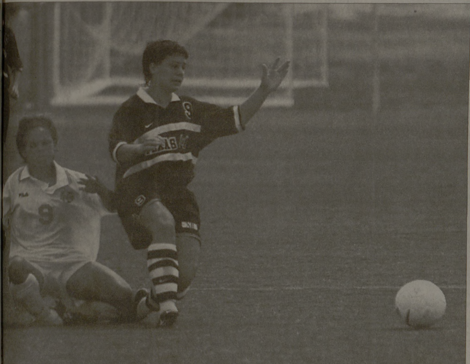
DAVE HOUSE /THE BATTALION