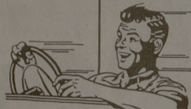
Hot Looks Great Performance