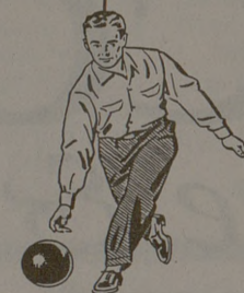
Join Bowling Team