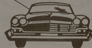
Some Other Car