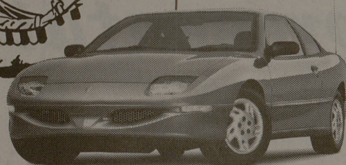
Excitement Rapture Bliss