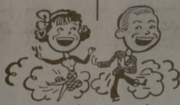
Land Big Job