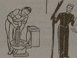
Working Two Jobs