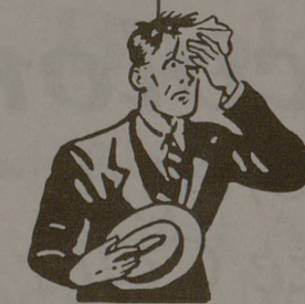
Boring Dullsville Miss