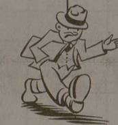
Interview After Interview