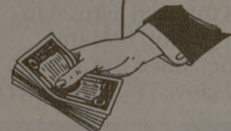
$400 Bucks of Incentive*