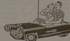
Drives Like a Shoebox Looks Like a Shoebox