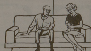
Living Back With Parents