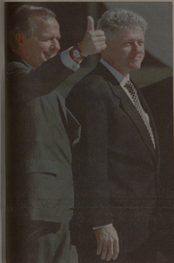
Former President George Bush and President Bill Clinton respond to the Aggie spirit.