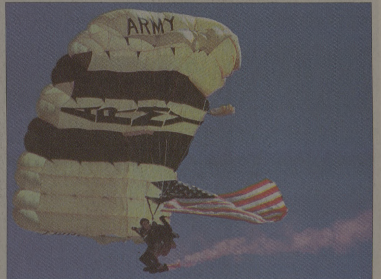
U.S. Army Golden Knights, with whom President Bush jumped earlier in the year, perform a parachute leap to conclude the library dedication.

Reagan said Bush filled a role similar to the role she played in former President Ronald Reagan's life. "For nearly half a century, many have described me as my husband's loyal partner," Reagan said, "and I'm proud to have that title. But today, I want to tell you about his other loyal partner, George Bush." Reagan said the Thursday lunches Bush and former president Ronald Reagan had during Reagan's two-term presidency brought the two men closer together.