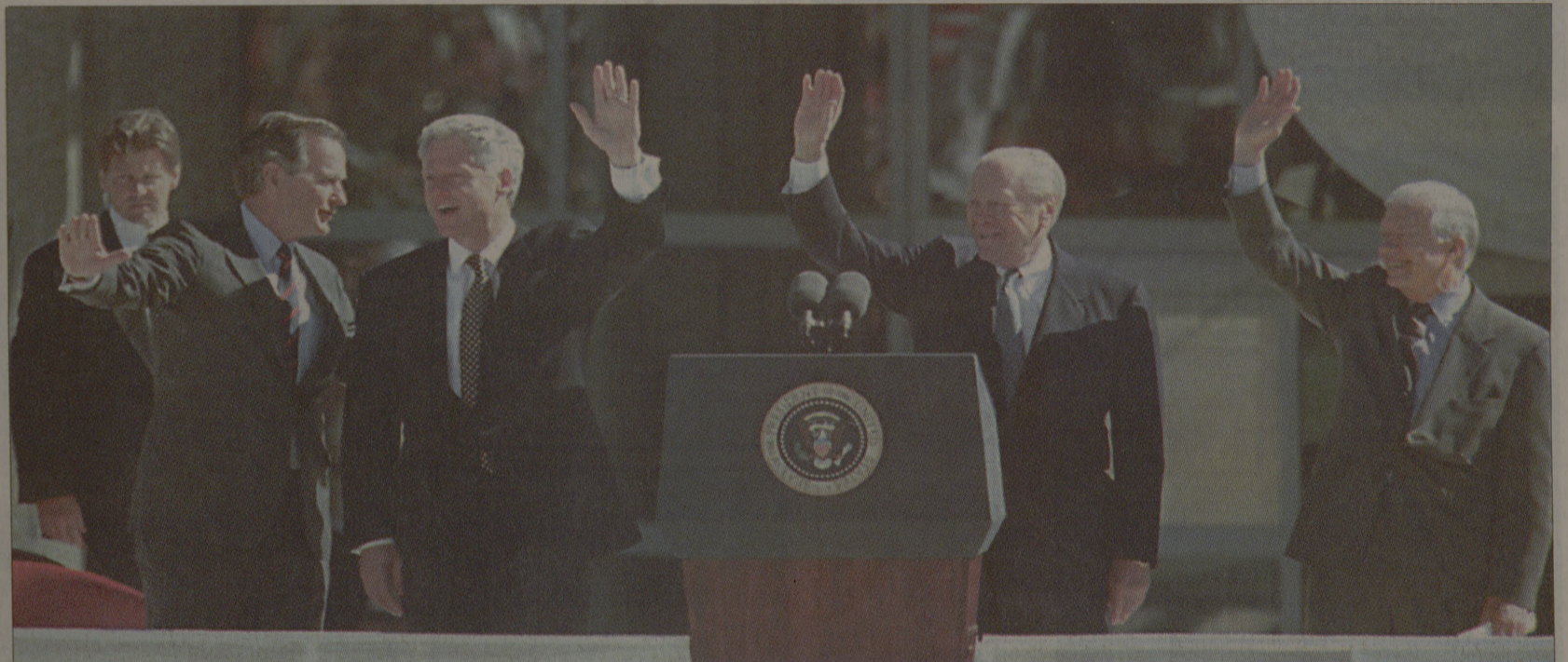
Former President George Bush , President Bill Clinton , former Presidents Gerald Ford and Jimmy Carter greet to the 20,000 attendees as they take the stage.