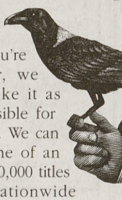
Edgar Allan Poe

If we don't have the book you're looking for, we want to make it as easy as possible for you to get it. We can order any one of an additional 200,000 titles from our nationwide