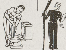
Working Two Jobs