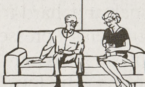
Living Back With Parents