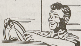
Hot Looks Great Performance