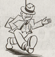
Interview After Interview