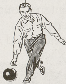
Join Bowling Team