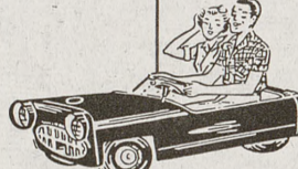
Drives Like a Shoebox Looks Like a Shoebox