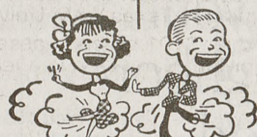
Land Big Job