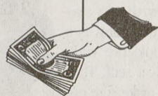
$400 Bucks of Incentive*