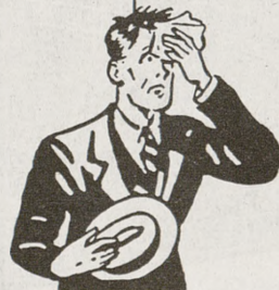
Boring Dullsville Miss