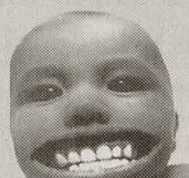
Tubthumper Chumbawamba Republic Records ★ (out of five)

I was expecting good things from Chumbawamba. Their first single from the album Tubthumper , "Tubthumping," is getting some airtime on American radio stations and is the No. 2 single on Billboard's modern rock chart as of Oct. 15. The song is good, and the album sounded promising, offering a few more songs of fun ear candy like the first single.