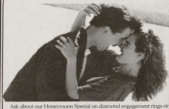
Ask about our Honeymoon Special on diamond engagement rings or a FREE Men's or Women's Tag Heuer. (Values up to $600.) Final Days! Sale ends Saturday, October 18th!