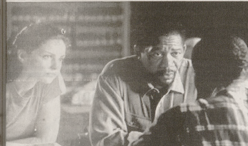
Ashley Judd and Morgan Freeman try to find a psychopathic kidnapper named Casanova in the new film, Kiss the Girls