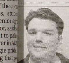
LEN CALLAWAY staff writer