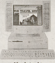
Power Macintosh® 4400/200 Small Business 32/2GB/12XCD/Multiple Scan 15AV/L2 33.6 Modem/Microsoft Office/Kbd Now $1,848 (or $35/month)** BEFORE REBATE