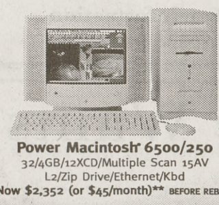
Power Macintosh® 6500/250 32/4GB/12XCD/Multiple Scan 15AV L2/Zip Drive/Ethernet/Kbd Now $2,352 (or $45/month)** BEFORE REBATE