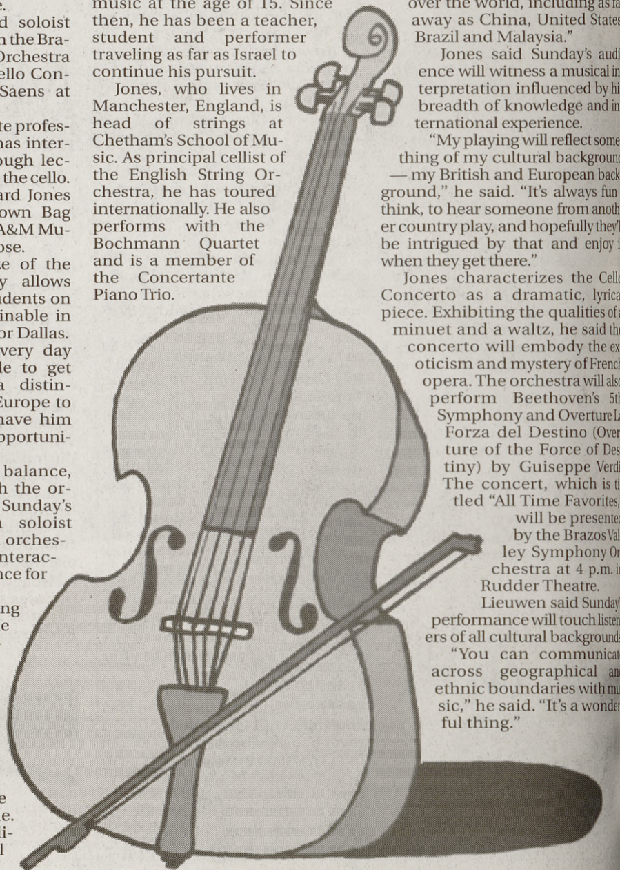
QUATRO OAKLEY/THE BATTALION

"You can communicate across geographical and ethnic boundaries with music," he said. "It's a wonderful thing."