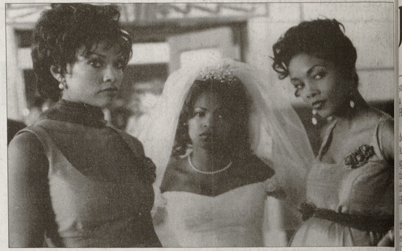
Vanessa Williams, Nia Long and Vivica A. Fox star as sisters in Soul Food .