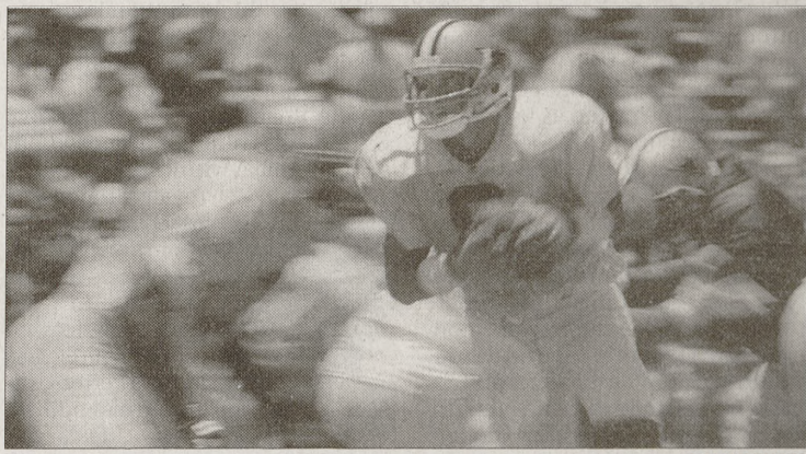
The Dallas Cowboys and quarterback Troy Aikman will try to get their offense going again after a poor showing against the Arizona Cardinals.

Puzzling Switzer is the Cowboys complete turnaround from two weeks ago when they opened with a 37-7 thumping of Pittsburgh.