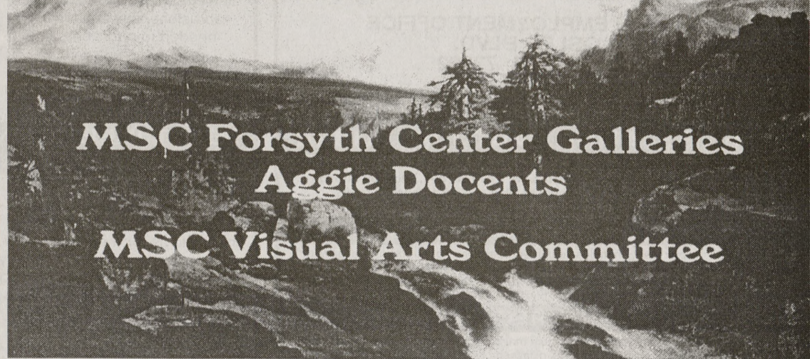
Thomas Moran, The Teton Range, Idaho, 1899

Now's your chance to make a scene! GET INVOLVED WITH ART AT TEXAS A&M!