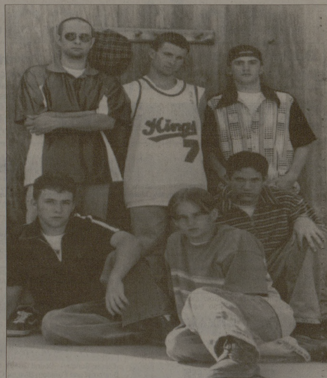
Plumblin will perform Friday at 3rd Floor Cantina in Bryan.