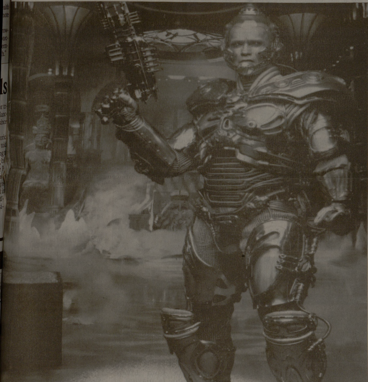
(Above) Arnold Schwarzenegger stars as Mr. Freeze in Batman and Robin . (Right) Other stars of the Warner Brothers movie are Alicia Silverstone as Batgirl, George Clooney as Batman and Chris O'Donnell as Robin.

Batman and Robin loses a star for the nipples in the costumes, a half star for its treatment of Bane and the ending and a star for a completely unnecessary song that is just too silly to be excused. Overall, though, Batman and Robin has plenty of explosions, interesting characters and a pretty good story. The ending is a bit weak, but it's a nice ride.