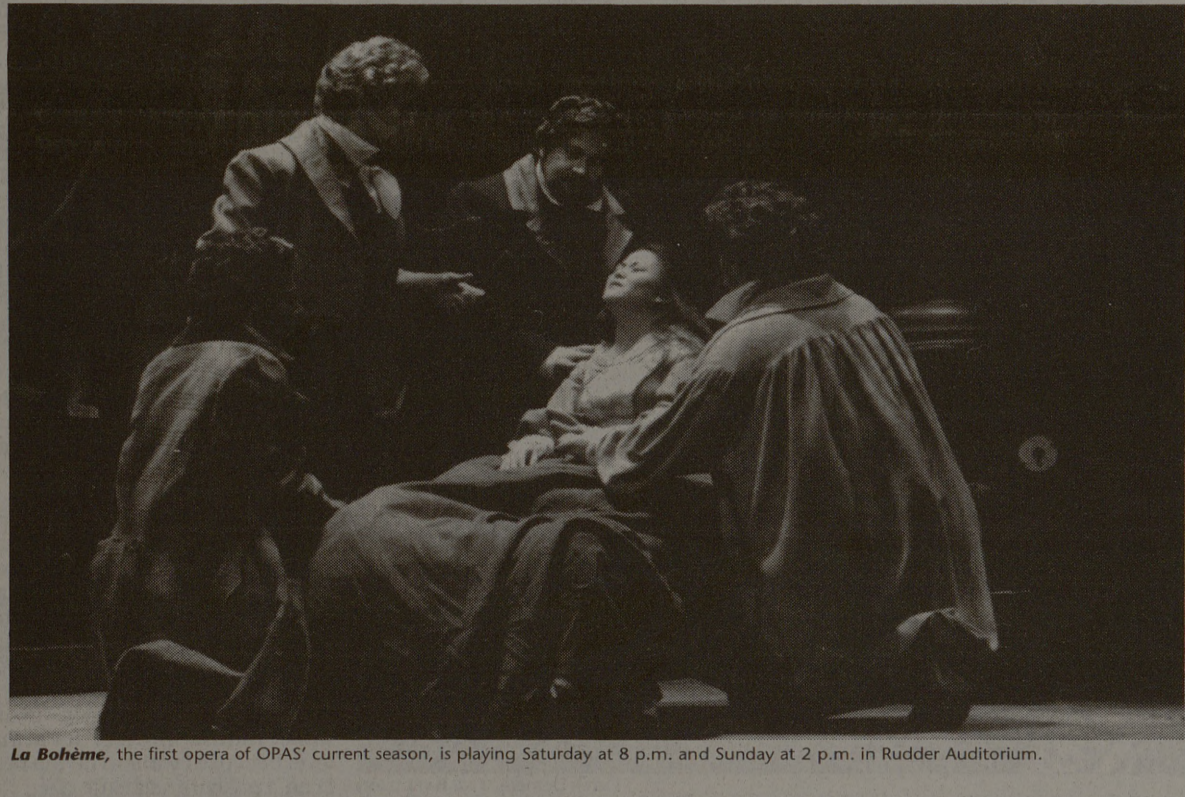
La Bohème, the first opera of OPAS' current season, is playing Saturday at 8 p.m. and Sunday at 2 p.m. in Rudder Auditorium.

"La Bohème is the most appropriate and probably the opera that 20-somethings can relate to the most. Such a combination will make for a spectacular production."