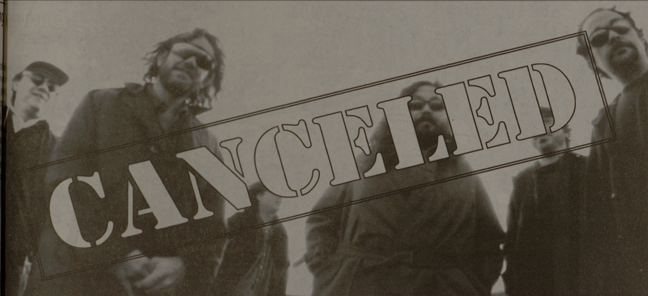
Widespread Panic, a rock band from Athens, Ga., was scheduled to play tonight at Rudder Auditorium.