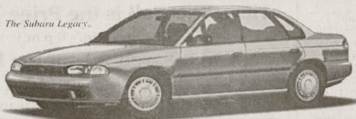
The Subaru Legacy.

NO MATTER HOW HARD YOU GRADE, WE'RE CERTAIN IT'LL PASS YOUR TEST.