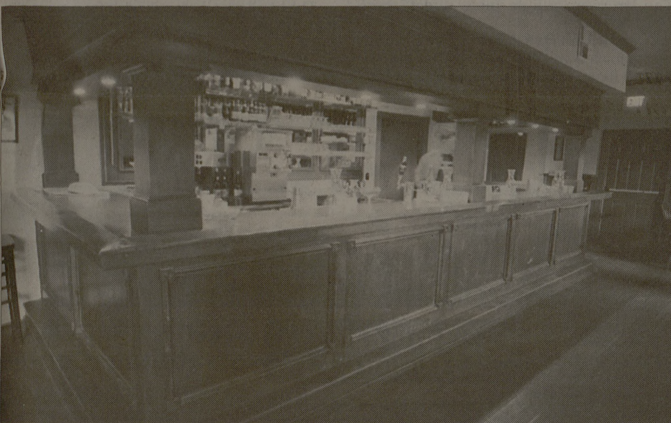
Left: The bar features mixed drinks, shots, Irish coffee, wine and draft beer.