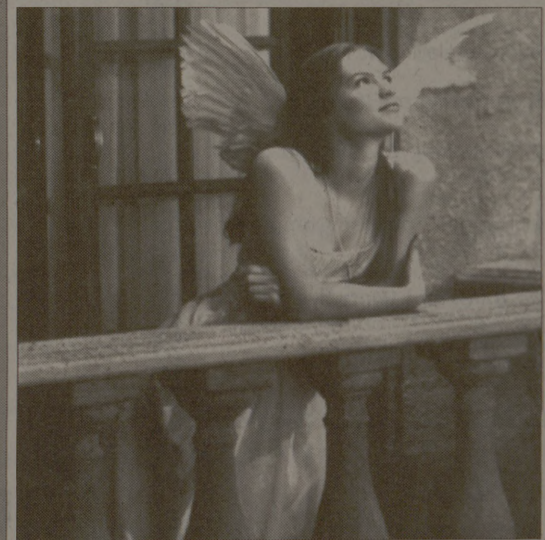
Claire Danes plays Juliet in Romeo and Juliet .

Love is an eternal fire which burns brighter in the midst of a torrential rainstorm — at least many would like to believe so. In the history of literature, no two star-crossed