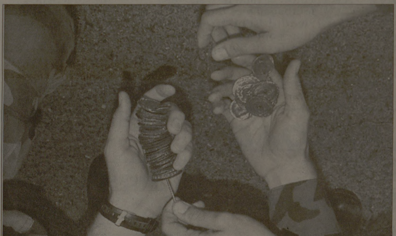
Freshmen in the Corps are required to put bottle caps on their shoes.

"Fish spurs are one of those things that ... might be hard to understand, but it's one of those things that you'll look back on and remember," Foster said.