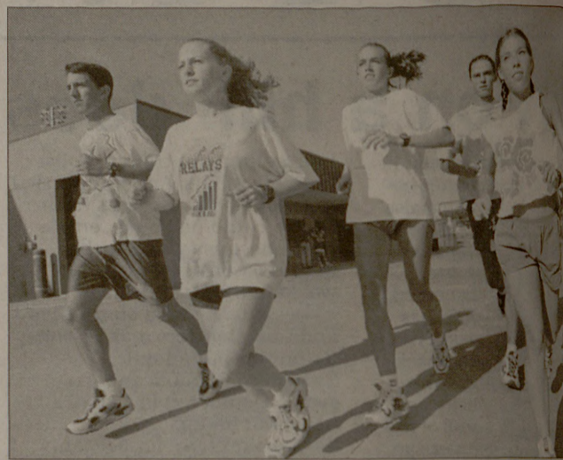
Members of the A&M Cross Country Team practice for the meet against North Texas Thursday afternoon.

Aggies' chance to show they can successfully compete against some of the nation's top individuals and teams.