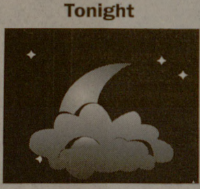
Partly cloudy with light easterly winds.