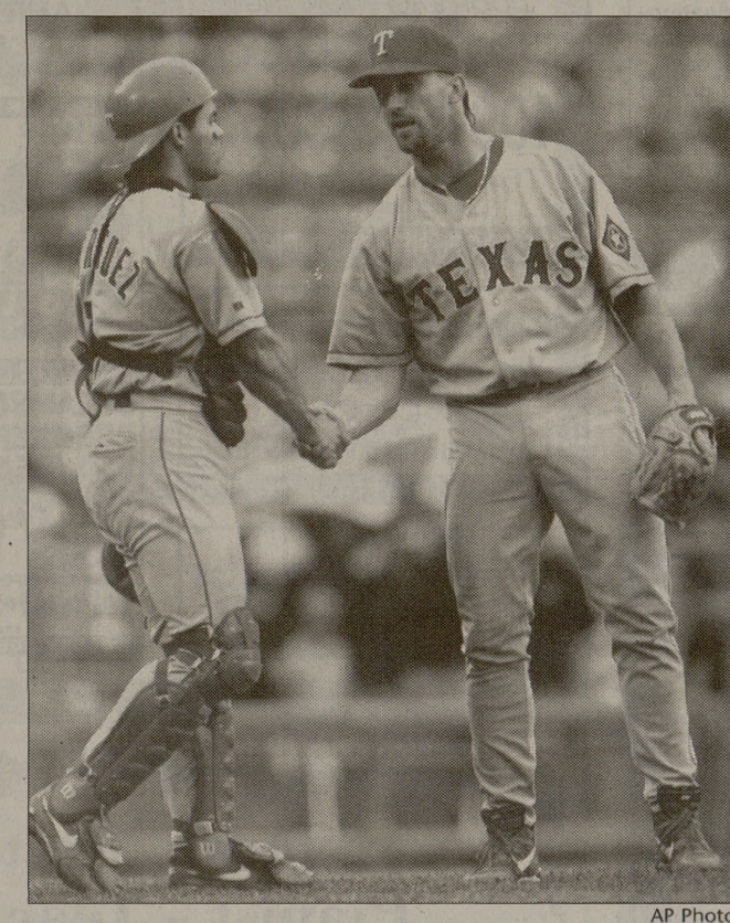
Texas catcher Ivan Rodriguez congratulates pitcher Bobby Witt after defeating Milwaukee 7-1, Sept. 8.

If the Rangers can get to the Yankee starters early to prevent comeback attempts against New York's overpowering bullpen, the Rangers will wake up Sunday morning in the American League Championship Series.