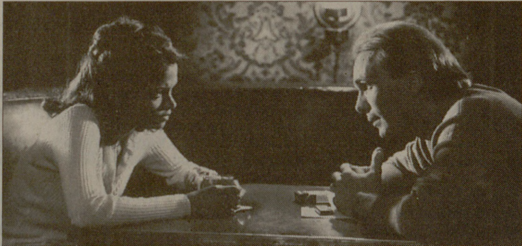
Halle Berry (right) and Christopher McDonald (left) star in The Rich Man's Wife , playing at Hollywood 16

Berry is convincing and likable as a woman trying to keep her marriage together, and her frail on-screen presence makes the audience feel for the