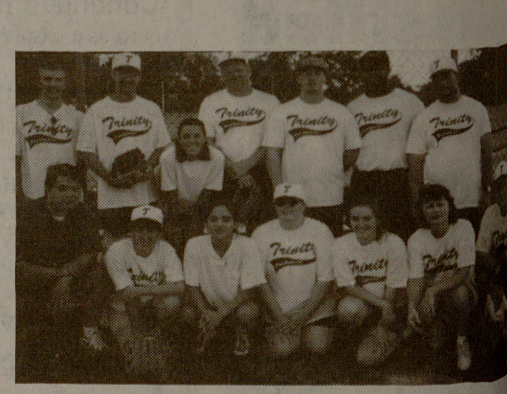
Ags, we lost every game. Join us and make us winners.

Come join us for Celebration Sunday as we kick off our new church in south College Station at Pebble Creek Elem. School on September 8, at 10:45 a.m.