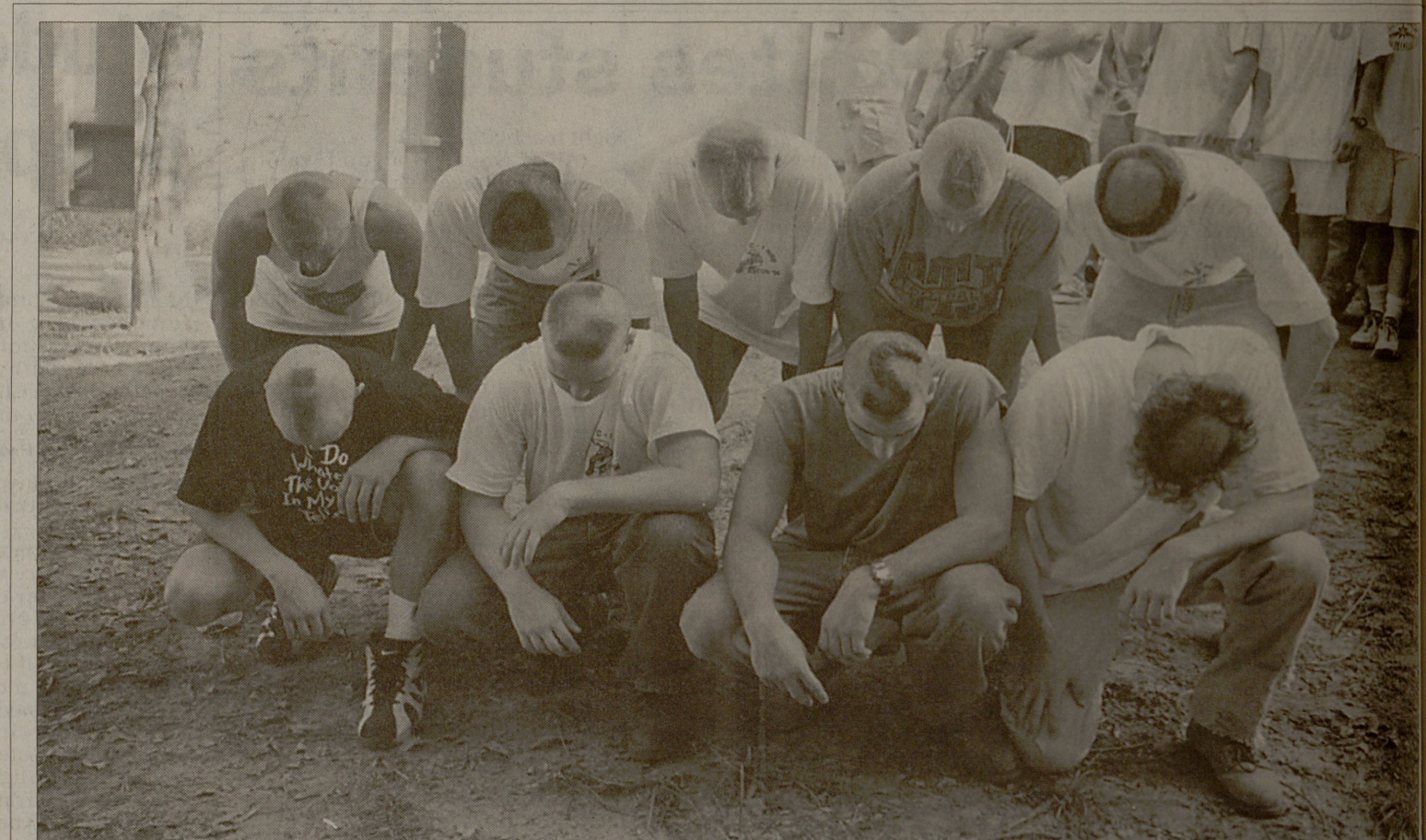
A New 'do

Officials said there's no guarantee that the money doesn't end up in the employees' pockets rather than going toward a particular charity or cause.