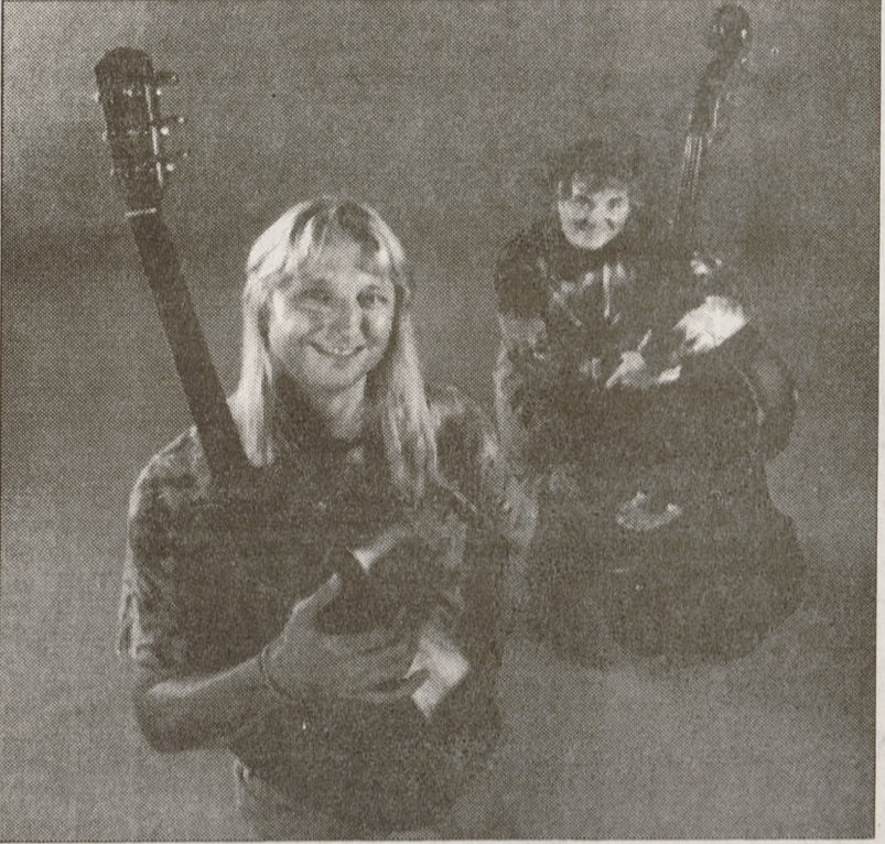
TROUT FISHING IN AMERICA

"You're doing your show, you have a lot of people show up and you're having a great night. That feels good."