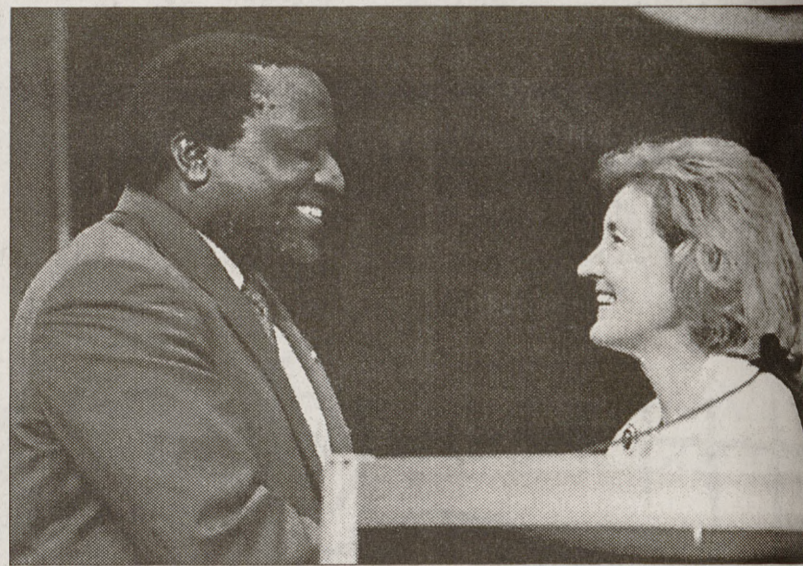
Sen. Kay Bailey Hutchison introduced Alan Keyes, former 1996 Republican presidential candidate, to the Texas delegates at their convention Friday.